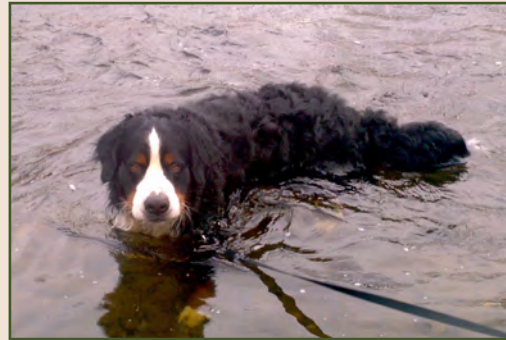
(Munson, Bernese Mountain Dog, swimming in the West Branch Farmington River)

Don't forget to properly wash and dry your pets after they leave waters known to contain didymo!